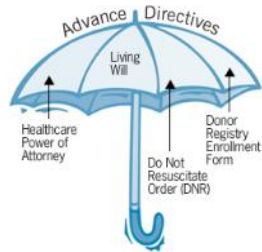
Power of Attorney, Living Will