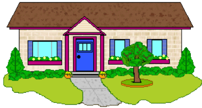
Home or Renter's Insurance